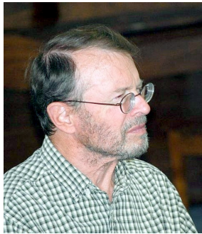
Who is this?